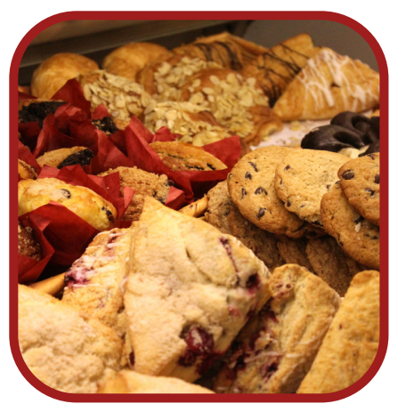
FIRST DAY OF CLASS TREATS IN LNCO/CTIHB | 11:30-12:30