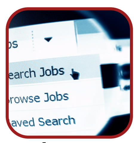
Job search FOUNDATION & RESUMES WORKSHOP